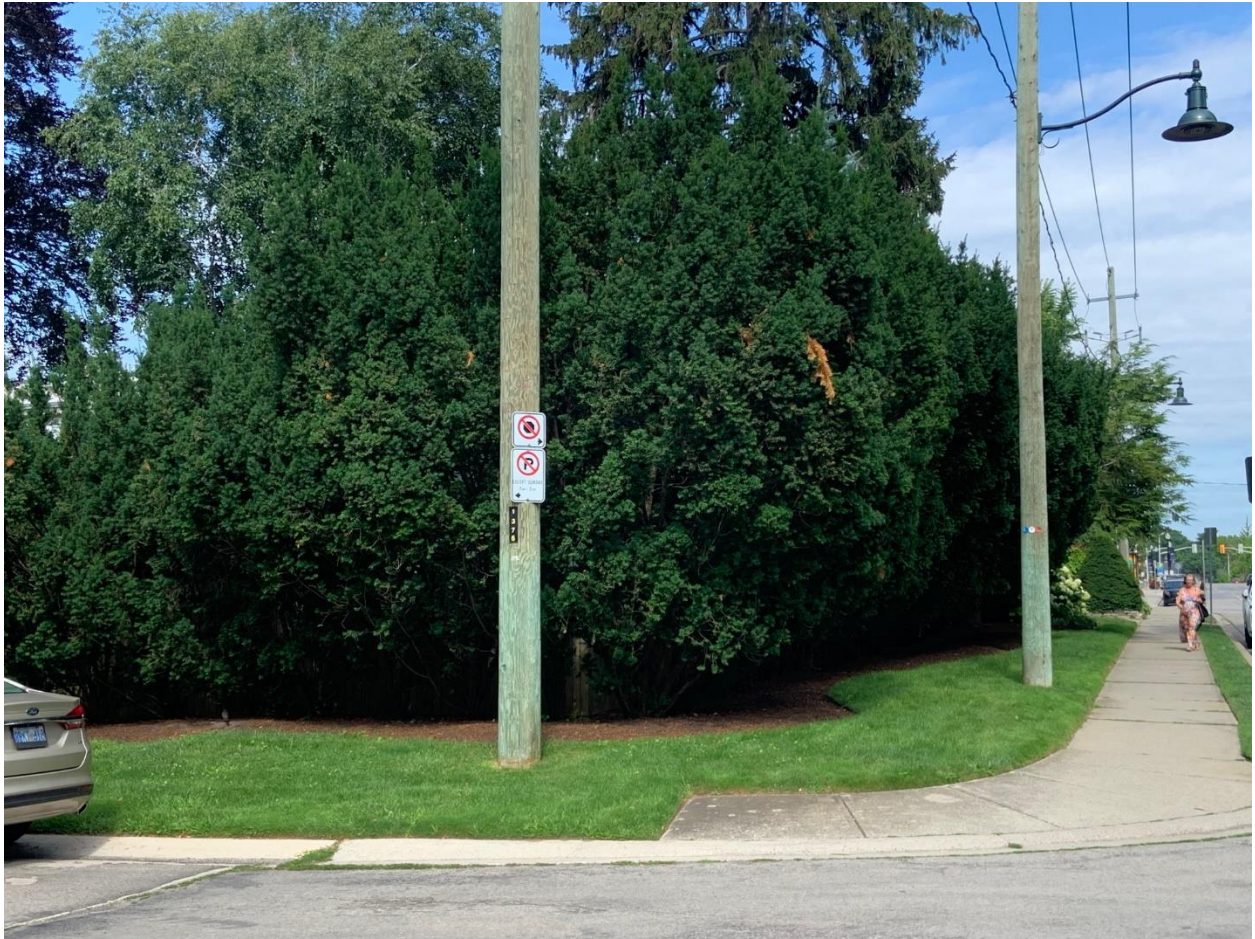
Northwest corner of Thomas and William

Overgrown vegetation - missing visual balance opportunity with house opposite at 53 Thomas Street