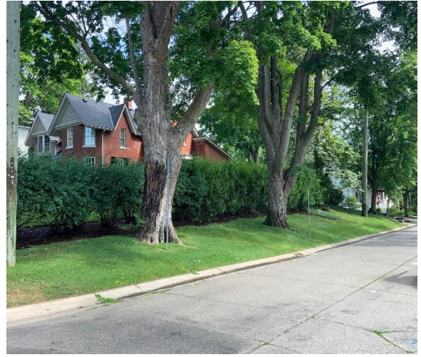
View looking east along William from Thomas – 53 Thomas on South; 65 Thomas on North View looking west towards corner of Thomas and William Street