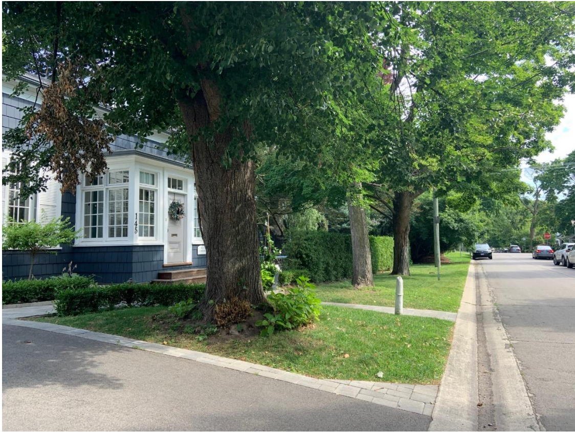
Views looking east along William Street – North Side 145 and South Side 148