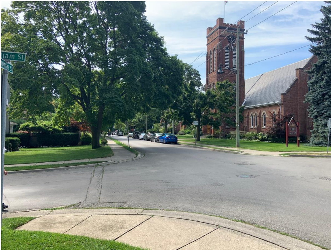
Corner of William and Thomas – visual balance noted in Block Analysis