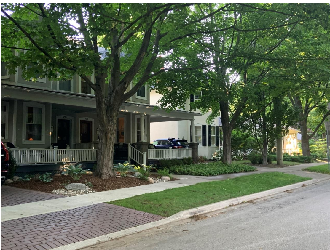
North side of William Street between Trafalgar and Reynolds