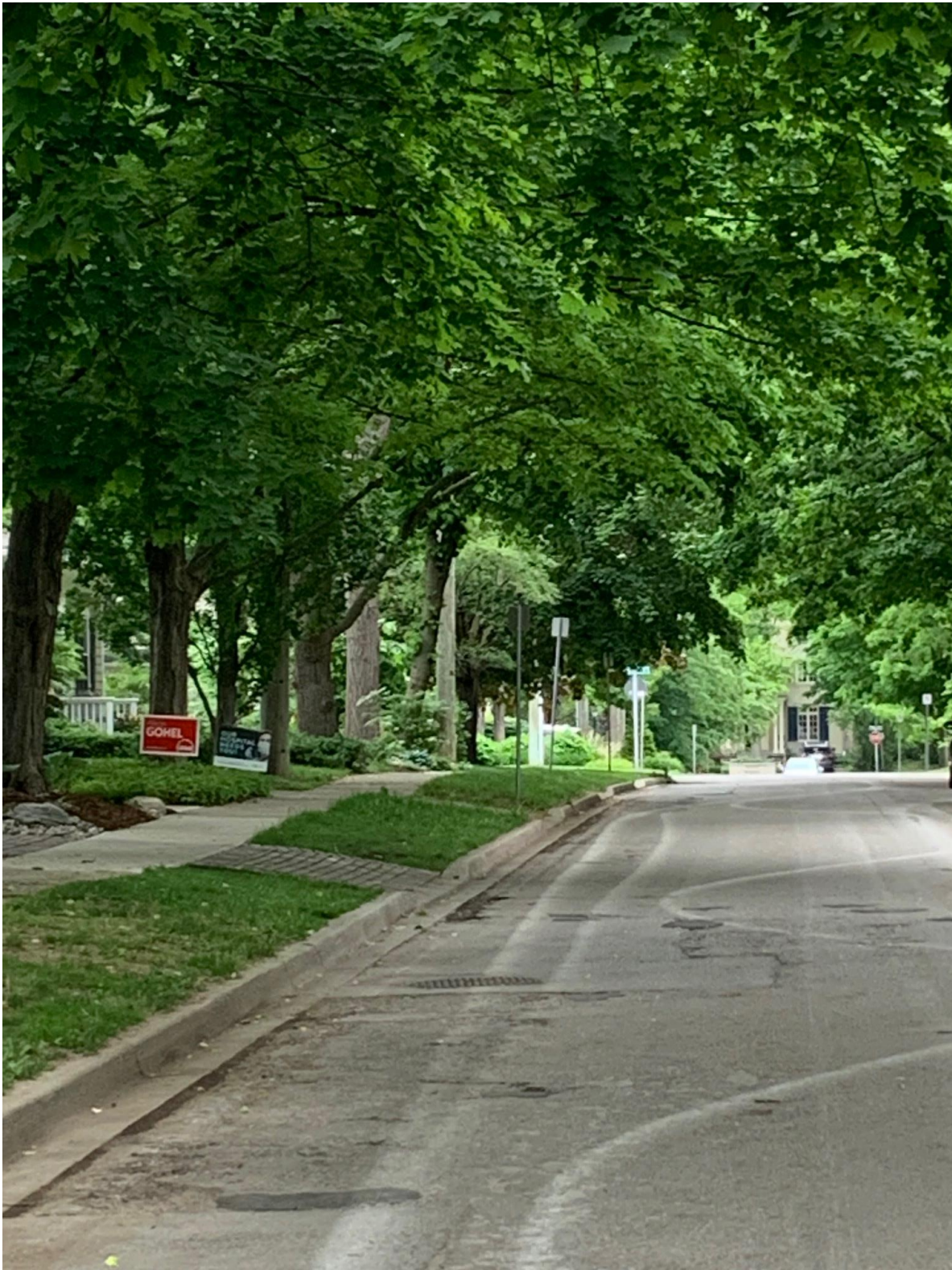
Mature Tree Canopy Along William Street