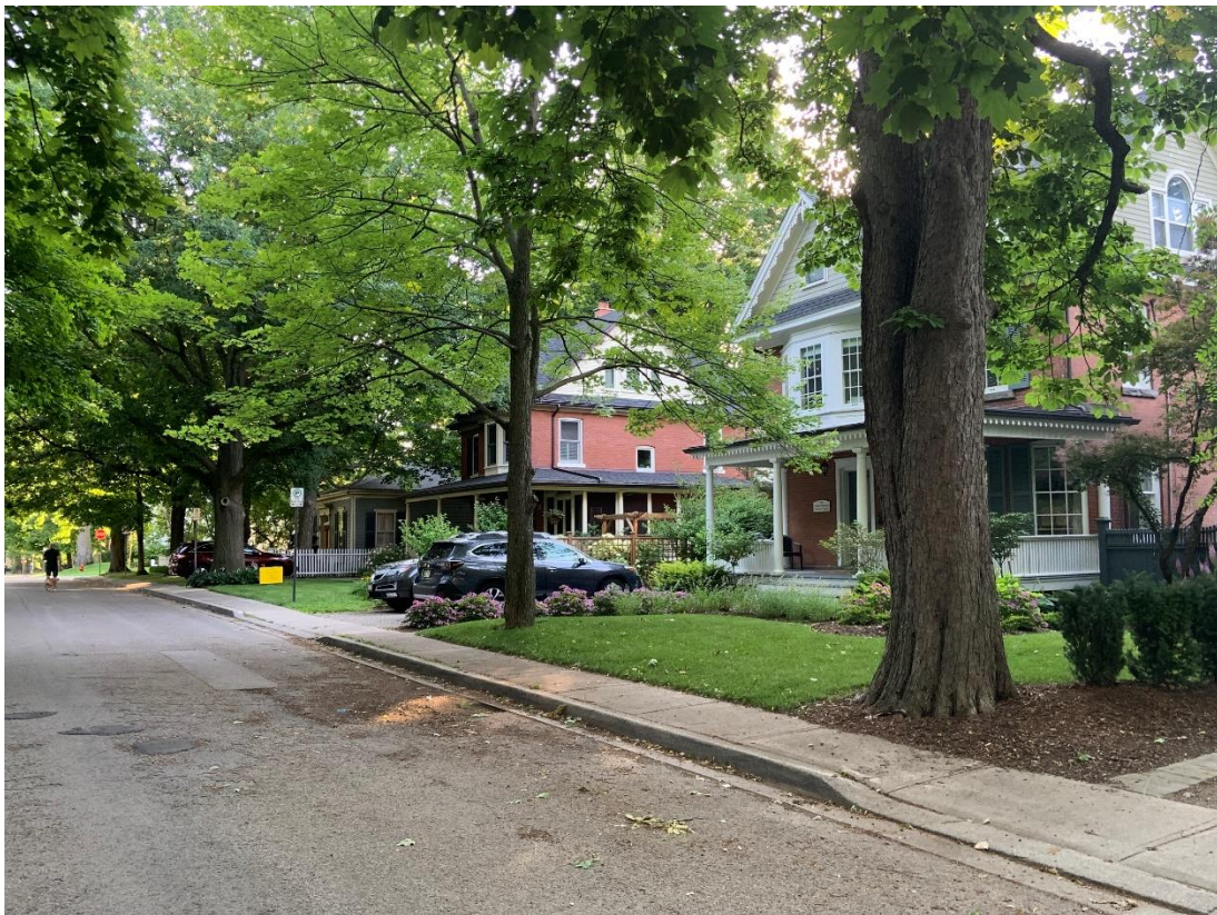
Southside of William Street between Trafalgar and Reynolds