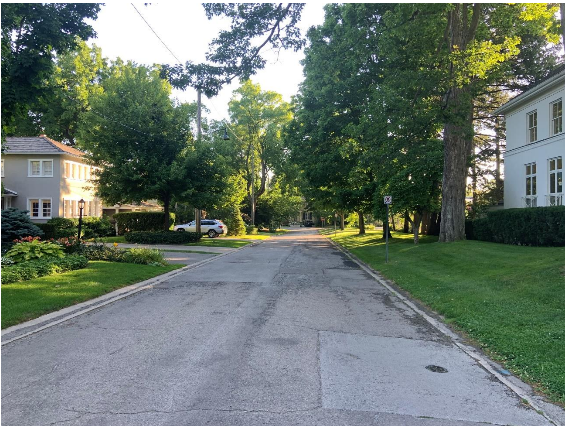
North side of William Street between Reynolds and Allan Street